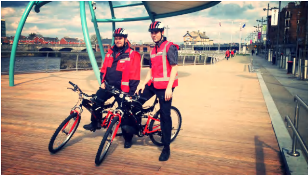
Figure 32: Active mobility teams