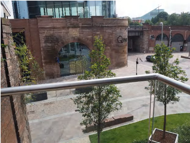
Figure 35: Architectural heritage- Handelsbeurs