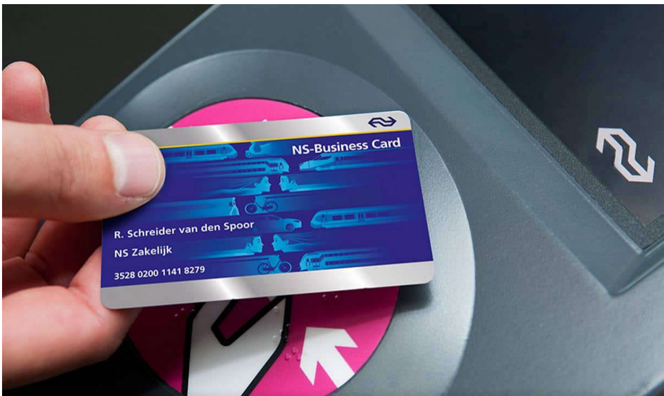
Figure 33: Co-creation with NS Business Card

We also endeavour to create aesthetically pleasing interiors and exteriors to our structures either as an artistic statement or to blend in with the surroundings. In many of our inner-city projects, such as Deansgate North in Manchester and Handelsbeurs in Antwerp, we have retained the architectural heritage.