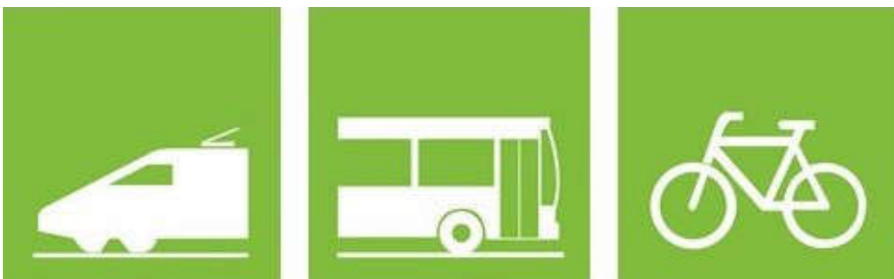
Figure 13: Proximity to alternative mobility options

Wherever possible, we give the public space back to the community and enable people to use space as they see fit. This means that parking facilities are constructed under parks and squares so that cars and coaches are off the streets and out of sight. And this means that