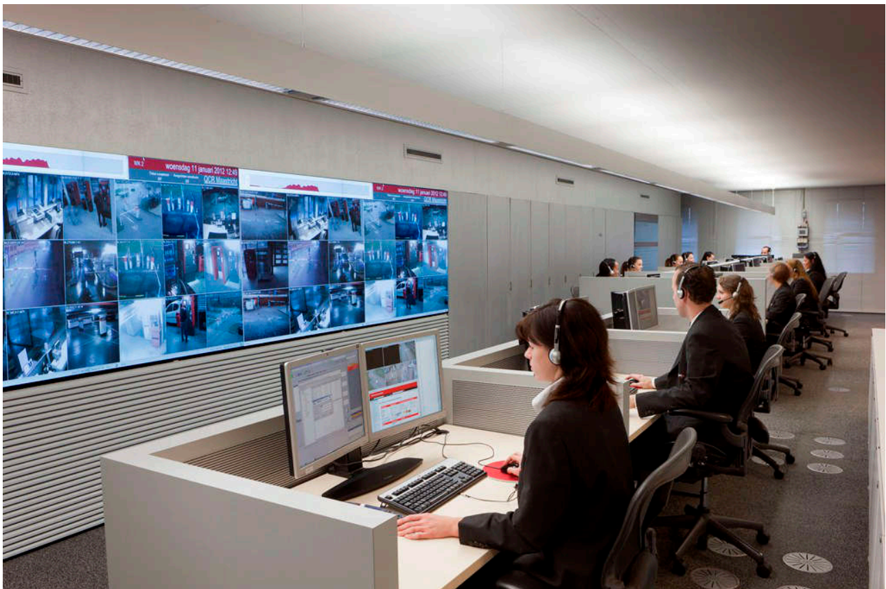
Figure 14: Q-Park Control Room (QCR)

In total we have 3,425 parking facilities offering 24/7 services.