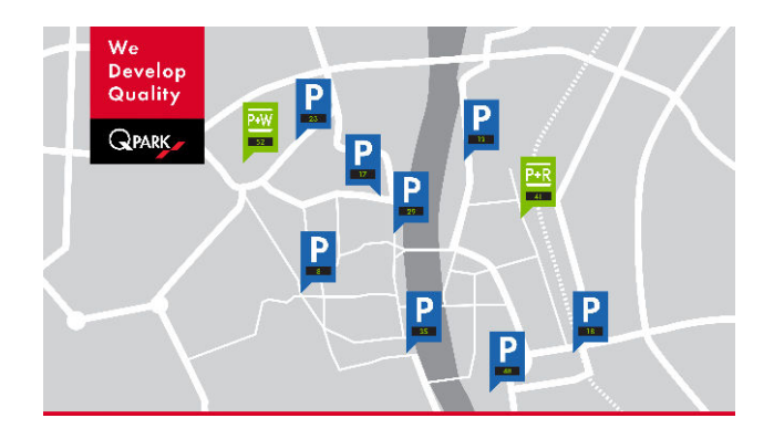
Figure 16: Strategic locations